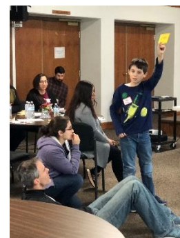
Interactive games are a good way to keep kids' attention