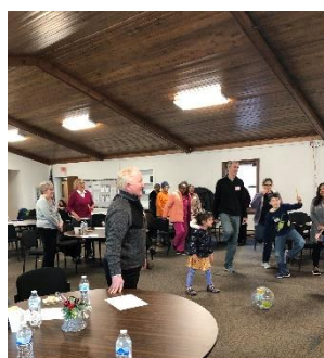
Young and old party-goers doing their best flamingo impersonations