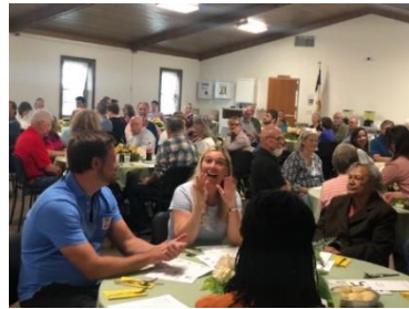
Above: guests waiting for their table to be called for dinner