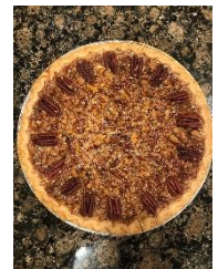
The $1,000 pecan pie