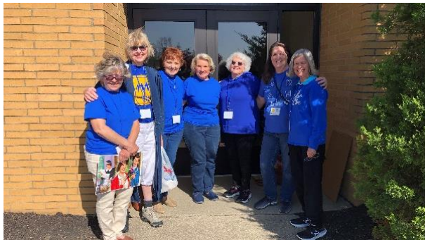
The Gerke Elementary Good News Club team from Berachah Church in Middletown