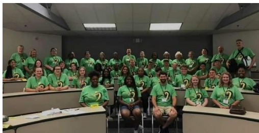
The 2022 CYIA training class