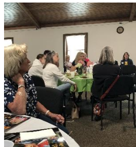
Listening to thought-provoking and inspiring testimonials