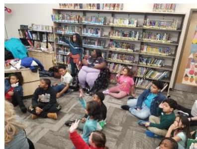
Left: Singing CEF songs; center and right: concentrating during the Bible lesson