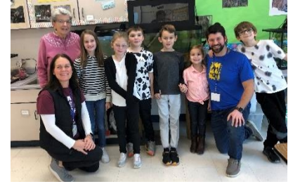
Bowman Primary School Club

It was January 2022 when I first heard of Child Evangelism Fellowship and the Good News Club at Donovan Elementary. Little did I know how involved I would become, and how quickly the Lord’s leading changed my family and my life. I am truly amazed what the Lord has done through the Greater Cincinnati Chapter over the past year.