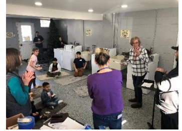
Club in the laundry room

Club started with a Christmas party in December and continued with two curriculum series. The last club meeting will be May 18 th and will end with an ice cream party.